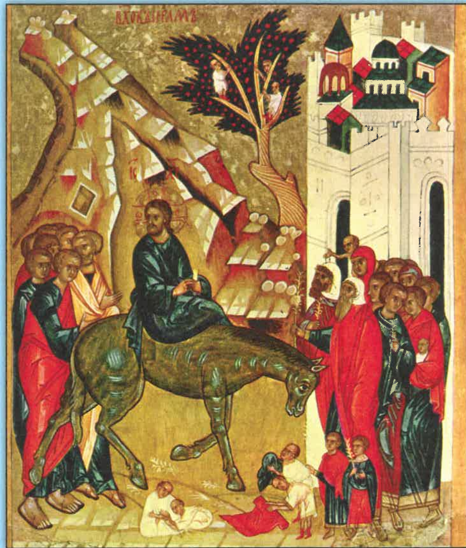
Icon of the Entrance into Jerusalem