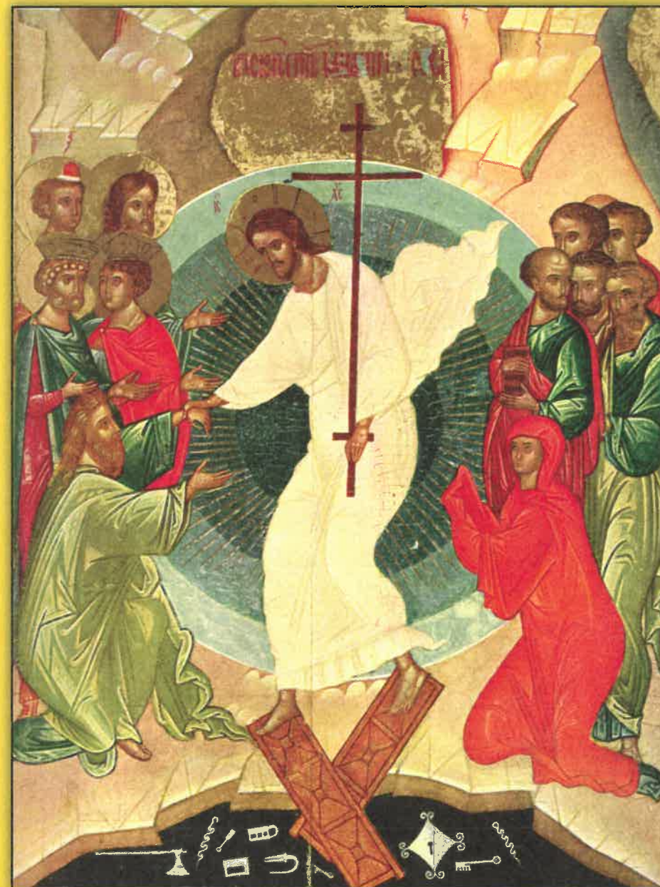
Icon of the Resurrection